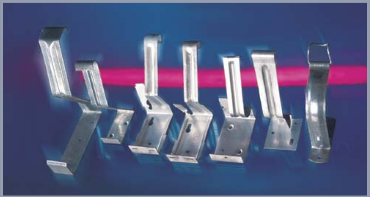
Selection of brackets for use with ZINCALUME® rainwater goods.

Both Galvanised steel and ZINCALUME® material can be used for brackets for ZINCALUME® rainwater goods. Galvanised steel is compatible with ZINCALUME® products and any inert catchment effect from ZINCALUME® roofing (or COLORSTEEL® products) on gutter brackets is insignificant.